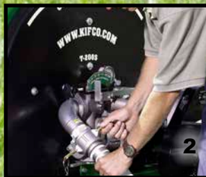
2 Attach Water Source