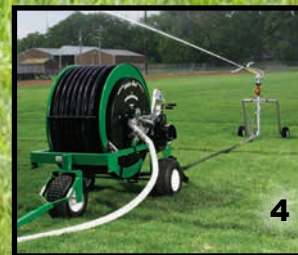
4 Turn On Water To Begin Operation

Machine Will Operate Unattended Turning Off Automatically At The End Of Its Run