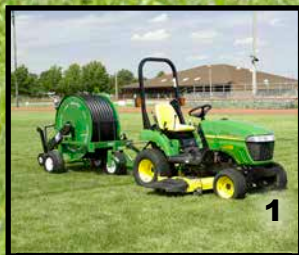
1 Pull Water-Reel Into Position