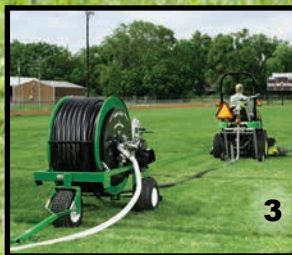
3 Pull Out Sprinkler Cart