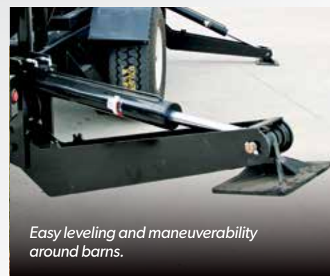
Easy leveling and maneuverability around barns.