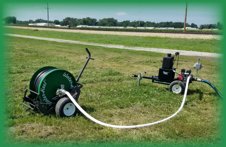
B110 with 9HP, Trailer Mounted Small Primary Pump Pictured