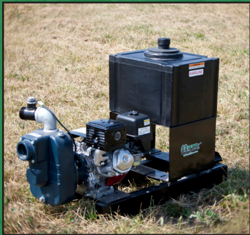
9 HP Small Primary Pump

Kifco's Primary Pumps are a pump & engine combination mounted on a rugged frame or trailer and are self-contained. Kifco's Primary Pumps are EPA emissions compliant for irrigation use and custom built packages can be ordered for most any application. See back page for Primary Pump/Water-Reel compatibility.