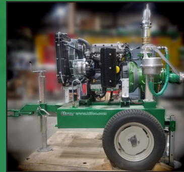
25HP Primary Pump