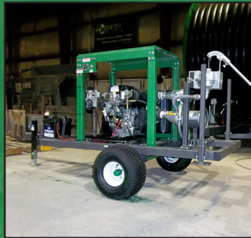
37HP Primary w/ Optional Trailer